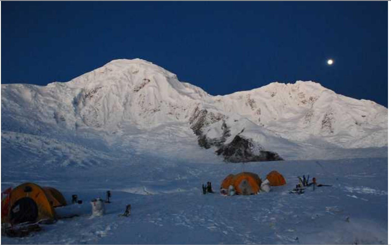
Lopchin (KG II, 6,805m, left) and KG III (6,726m) seen from Camp 1 on Ata Glacier at 4,890m. Moon is setting behind unclimbed KG III. Route on first ascent of Lopchin took left skyline. Tatsuo Inoue

The expedition comprised two Tibetans and eight Chinese led by Dong Fan and seven Japanese led by me. Nine members were students. After a three-day, 920km drive from Lhasa to Lhagu and an additional one-day walk, we established base camp on October 18 in a moraine valley close to the snout of the north tongue of the Ata Glacier (4,320m, N 29°13.17', E 96°49.19'). Ten porters, who each ferried loads seven times, quickly established a deposit camp at 4,400m, below the first icefall.