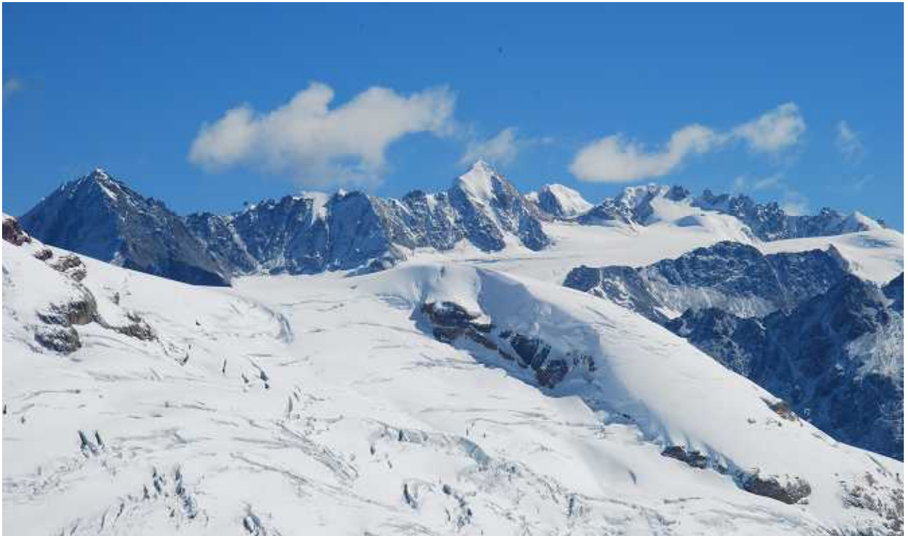
Eastern Kangri Garpo seen from 5,050m on Ata Glacier. On left is KG 27 (ca 5,850m), while fine pointed peak is KG 26 (ca 6,000m). Behind it and to right is Gheni (6,150m). Tatsuo Inoue

On November 5 five members left Camp 2 at 3:30 a.m. under a full moon. Strong wind, deep snow, and difficult crevasses slowed progress, and three returned. Deqing Ouzhu and Ciren Danda, Tibetan students with the CUG, continued up the southeast ridge of KG II and reached its summit at 1:18 p.m. in a mist. Above the col on the main divide between Ruoni and KG II (we refer to these two peaks and KG III as the Three Ata Sisters), the ridge was wide and gently angled to ca 6,300m. Above, it became steeper (average of 40°) and covered with deep, soft snow; not difficult but avalanche prone.