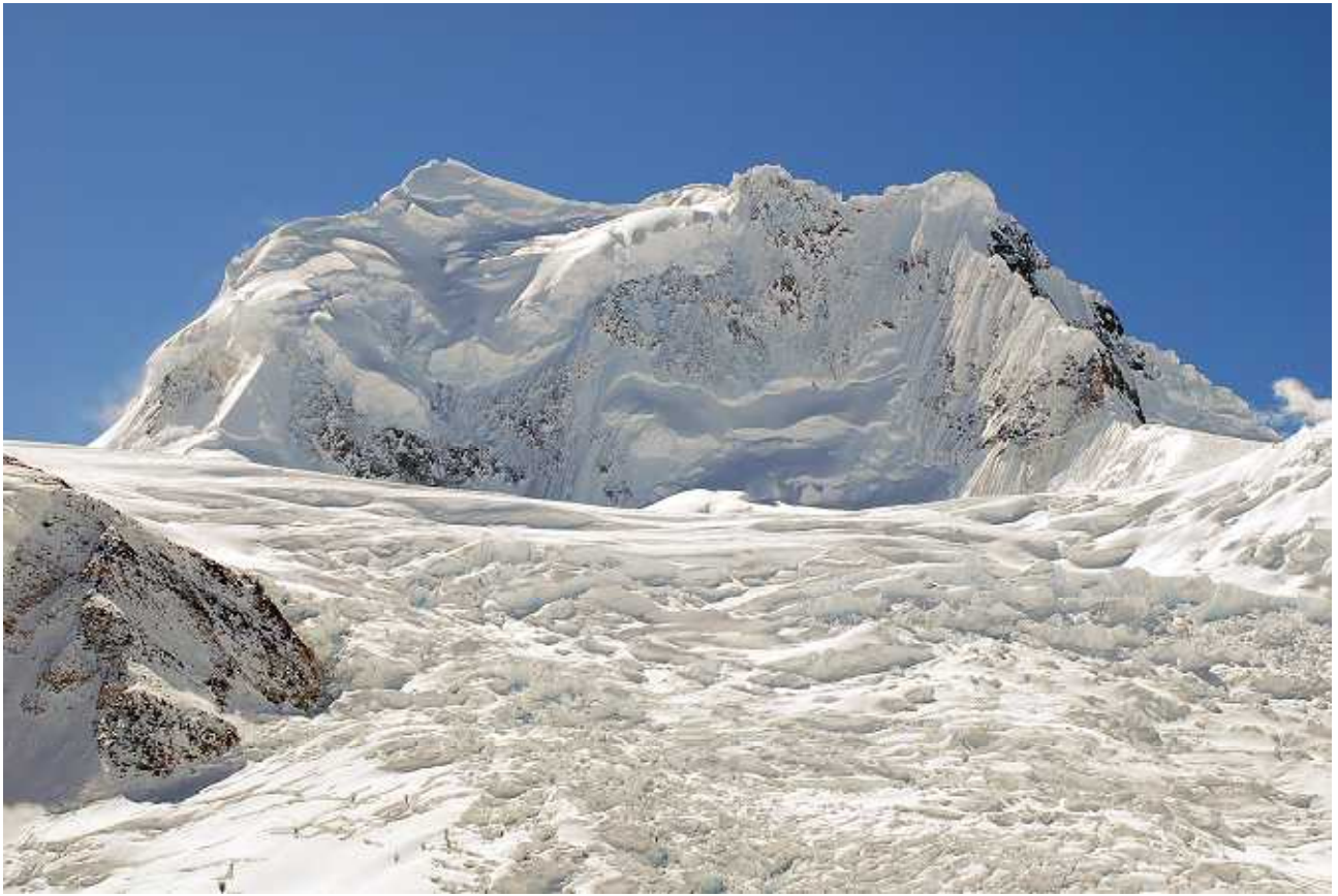
East-northeast face of unclimbed Ruoni (6,882m), highest peak in Kangri Garpo, seen from 5,050m on Ata Glacier. Tatsuo Inoue

It was obvious there had been little snowfall during the summer and early autumn, which was unusual. Trekkers and climbers who have visited the region in October and November report heavy snowfall and frequent avalanches. The Kobe University attempts on Ruoni in 2003 (AAJ 2004) and 2007 (AAJ 2008) were defeated by bad weather and excessive snow. These expeditions reported 40-50cm of fresh snow each night for periods of three or four days. In contrast our expedition experienced a maximum of only 10cm on the glacier, which was quickly melted by strong sunshine. Although we had only two perfect days and over 20 snowy ones, no snow accumulated on the glacier. This had its good and bad points: glacier travel was relatively easy, but higher, where temperatures remained lower, deep snow on the ridges made for hard work and dangerous conditions.